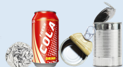
Aluminum & Steel Cans (Foil & empty food & beverage cans)