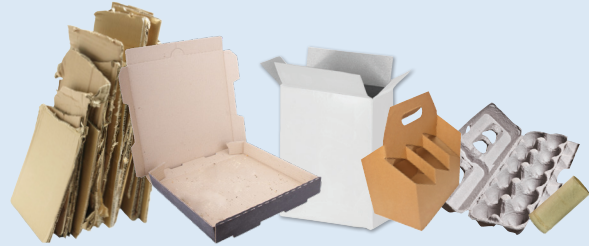
Cardboard & Boxboard (Clean & dry)