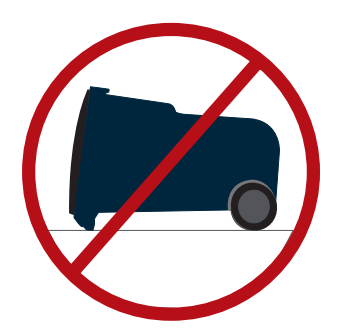
Containers must remain upright for pickup