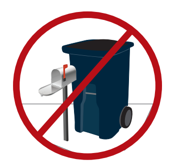
Keep container clear of all obstructions