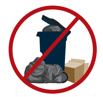
Keep all materials inside the container