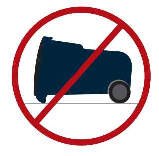
Containers must remain upright for pickup