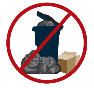
Keep all materials inside the container