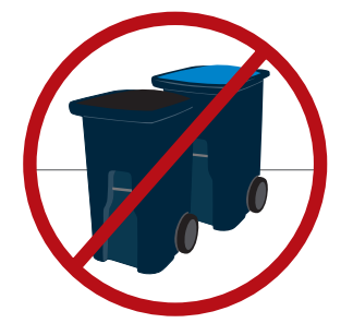
Do not place containers back to back