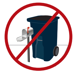
Keep container clear of all obstructions