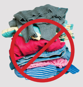
CLOTHING / TEXTILES DON'T BELONG