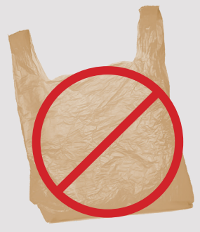
PLASTIC BAGS DON'T BELONG