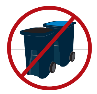
Do not place containers back to back