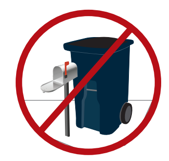
Keep container clear of all obstructions