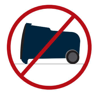
Containers must remain upright for pickup