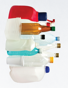
(5-gallon pails, laundry baskets) Large Rigid Plastics