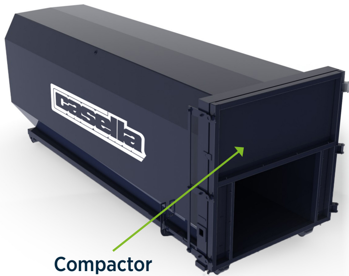
Compactor Receiver Box