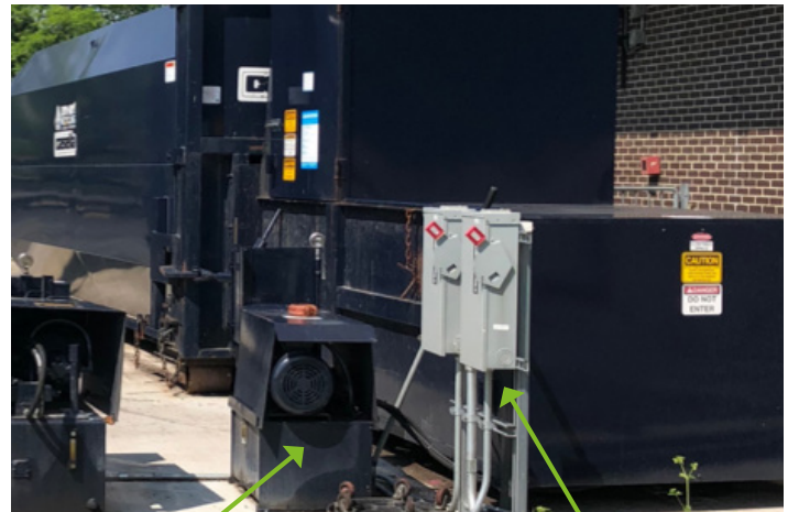
Compactor Power Unit with Emergency Stop Button