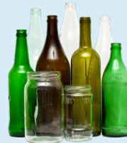
Glass Bottles & Jars (Empty food & beverage bottles & jars)