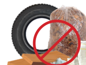
WOOD, WASTE, OR TIRES