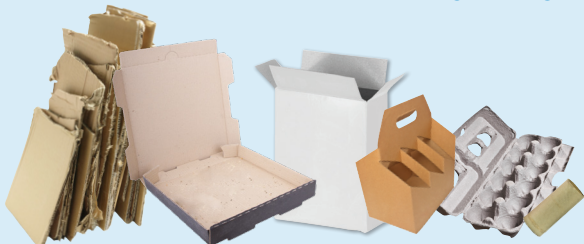
Cardboard & Boxboard (Clean & dry)