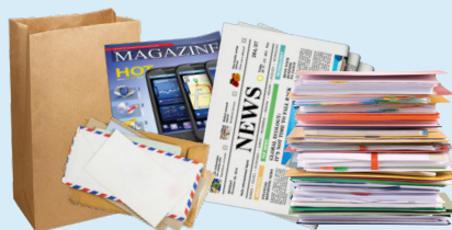
Junk Mail, Periodicals, & Office Paper (Paper bags, envelopes, & catalogs)