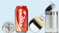
Aluminum & Steel Cans (Foil & empty food & beverage cans)