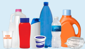
Plastic Bottles, Jugs, Tubs, & Lids (Empty kitchen, laundry, & bath containers & clamshells)