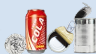
Aluminum & Steel Cans (Clean foil & empty food or beverage cans)