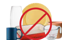
CERAMICS OR BAKING GLASS

For information about Residential Curbside Terms & Conditions, visit casella.com/residential-terms