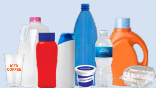
Plastic Bottles, Jugs, Tubs & Lids (Empty kitchen, laundry & bath containers & clamshell packaging)