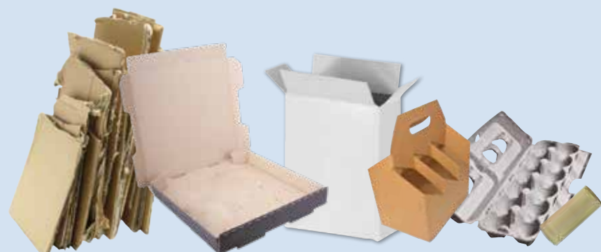
Corrugated & Boxboard (Clean & dry)