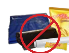
PLASTIC WRAP, FILMS, OR TARPS