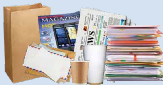
Junk Mail, Periodicals, Office Paper & Paper Cups (Paper bags & cups, envelopes & catalogs)