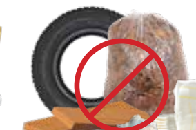
WOOD, WASTE, OR TIRES