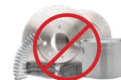
SCRAP METAL ITEMS