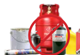
HAZARDOUS MATERIALS OR EXPLOSIVES