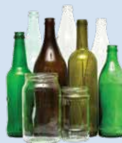
Glass Bottles & Jars (Empty food & drink containers only)